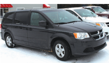
2011 DODGE GRAND CARAVAN Stow-N-Go seating. Very nice van. AS LOW AS $249 A MONTH