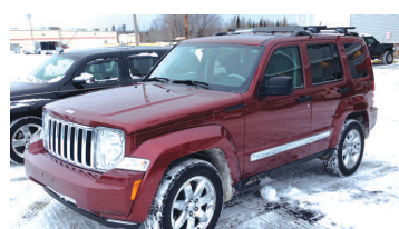
2008 JEEP LIBERTY LIMITED 4x4, leather, sunroof, tow pkg, nice AS LOW AS $199 A MONTH