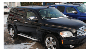
2006 CHEVY HHR Sunroof, leather, very nice. AS LOW AS $179 A MONTH

We are postponing our car giveaway promotion until spring (when it finally stops snowing) but you can still stop by to register to win anytime.