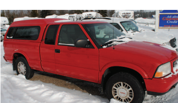
2000 GMC SONOMA SLS Ext cab, tow pkg. AS LOW AS $99 A MONTH