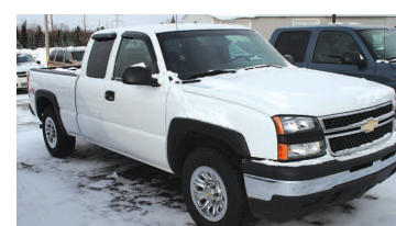
2006 CHEVY SILVERADO 1500 LT3 Ext cab, 4x4, seats 6, bedliner, tow pkg, Pioneer sound. AS LOW AS $199 A MONTH