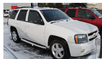
2008 CHEVY TRAILBLAZER LT 4WD, sunroof, tow pkg, leather, loaded. Only 75 K. AS LOW AS $199 A MONTH