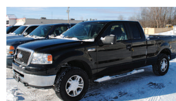
2007 FORD F-150 XLT 4x4, bedliner, tow pkg, seats 5, 5.4 Triton. AS LOW AS $199 A MONTH