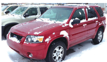
2005 FORD ESCAPE 4WD, leather, sunroof, tow pkg. AS LOW AS $199 A MONTH