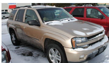
2004 CHEVY TRAILBLAZER LT Leather, 4WD, Pioneer sound, tow pkg. AS LOW AS $159 A MONTH