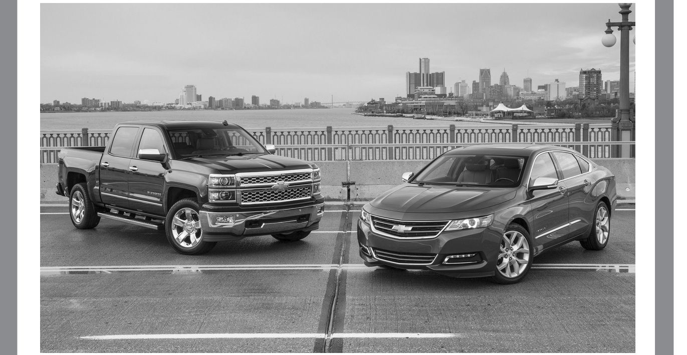
Cars.com picked all-new models from Chevrolet – the Impala sedan and the Silverado full-size pickup – as its Best Car and Best Truck of 2014, awards presented each January during the North American International Auto Show.