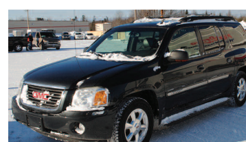
2004 GMC ENVOY XL Leather, 3rd row seat, 4WD, tow pkg, loaded. AS LOW AS $199 A MONTH