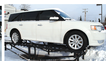
2009 FORD FLEX SEL AWD, good MPG, only 79 K. AS LOW AS $249 A MONTH