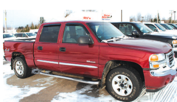
2006 GMC SIERRA 4WD, 4 door, bedliner, tow pkg. AS LOW AS $199 A MONTH