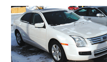
2009 FORD FUSION SE Sunroof, 4 cyl, 28 MPG. AS LOW AS $199 A MONTH