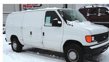
2006 FORD E-250 CARGO VAN Lots of room for work. Air, new rubber. Only 89 K. AS LOW AS $189 A MONTH