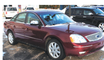
2005 FORD FIVE HUNDRED AWD, leather, sunroof. AS LOW AS $169 A MONTH