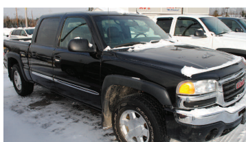
2004 GMC SIERRA SLT Z-71 OFF ROAD 4x4, crew cab, short bed, tow pkg, bedliner, leather. AS LOW AS $199 A MONTH