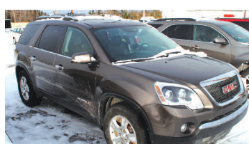
2008 GMC ACADIA SLT-1 AWD, heated, leather seats. AS LOW AS $219 A MONTH