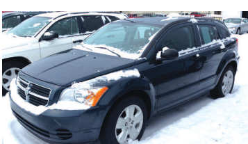
2007 DODGE CALIBER SXT 93 K. Great MPG AS LOW AS $199 A MONTH