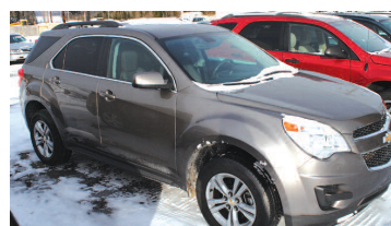
2010 CHEVY EQUINOX LT-2 Only 41 K, 25 MPG, tow pkg. AS LOW AS $219 A MONTH