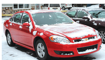
2010 CHEVY IMPALA LT Loaded, 29 MPG, very nice. AS LOW AS $189 A MONTH